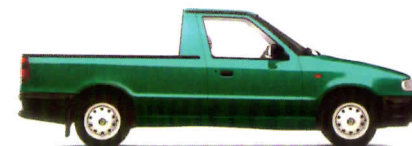
Frisian Green 8Y8Y