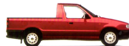
Paprika Red 3M3M