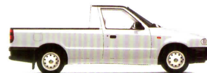
Dove White T7T7

The Škoda Pickup goes out of its way to protect your investment. Under that showroom shine is a tough body with galvanised stress points and wax filled cavities. It adds an extra depth of protection, keeping both weather and corrosion at bay.